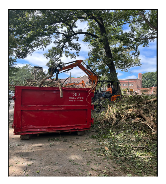
Grubbing removal from site