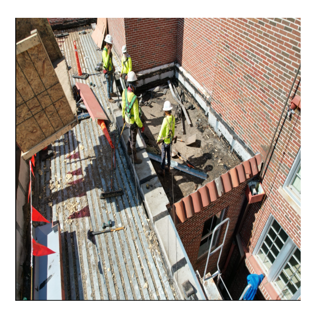
Begin roof demo and re-roof