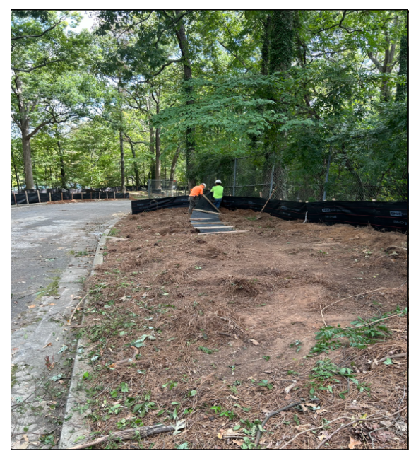
Silt fence install and erosion is near completion