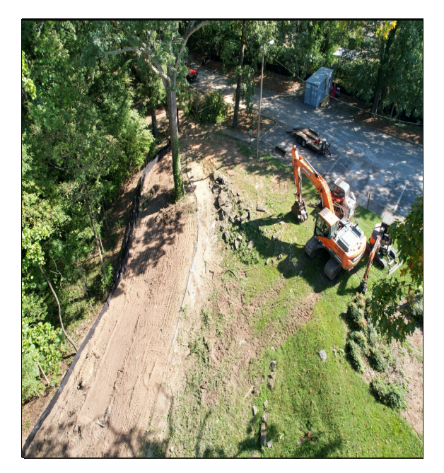
Prepping to begin grading and scheduling for 7 day walk to begin excavation